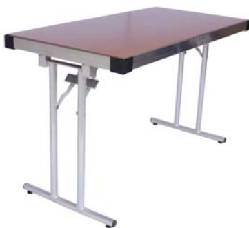
AFTT 1860 1800 x 600 mm 10.2kg AFTT 1560 1500 x 600 mm 9.2kg