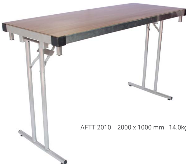
AFTT 2010 2000 x 1000 mm 14.0kg

All trolleys have 4 swivel wheels (2 lockable)