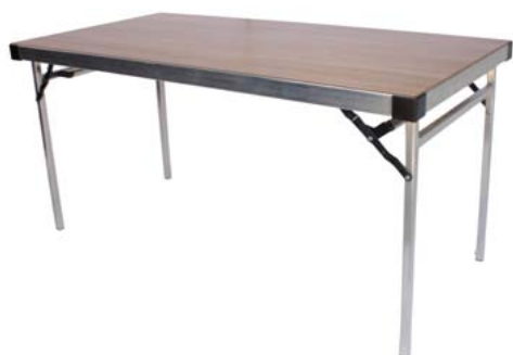
Alu-Lite Table with Standard Leg

Whether you need folding tables for meetings or banqueting or you need the flexibility to handle both in your venue, the Alu-Lite table is the perfect solution. Alu-Lite folding tables are lightweight and strong, stable and easy to use.