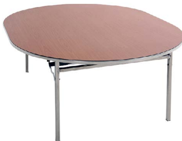
AFT 2015 2000 x 1500 mm Oval 19.6kg

Table trollies for round and trestle tables also available (see next page)