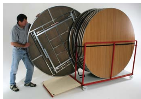
TT 180 1905 x 800 x 1185 mm