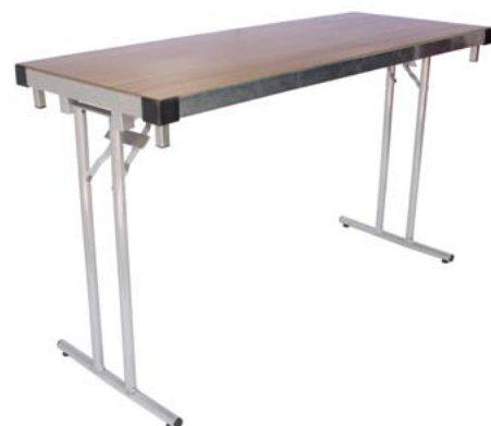
Alu-Lite Table with T-Leg