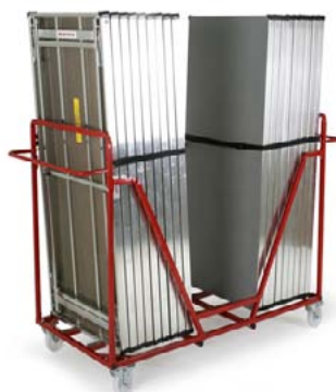
TT 1905 x 825 x 1185 mm

Holds up to 25 rectangular tables Max. 10 x 1500 mm Ø round tables Max. 9 x 1200 mm Ø round tables