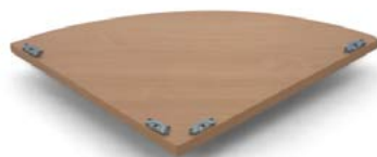
AFT SEG 72° segment for modular tables 9.8kg

Also available (not shown): Bench 1800 x 285 x 460 mm 8.0kg