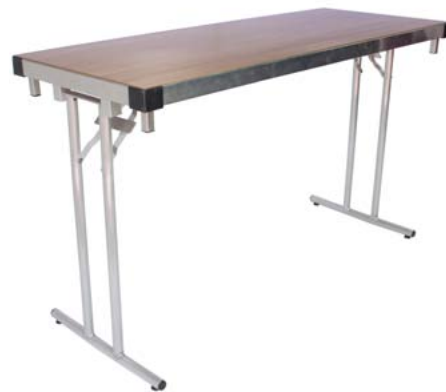
AFTT 1845 1800 x 450 mm 9.7kg AFTT 1645 1600 x 450 mm 8.5kg