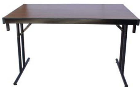
AFTT 2275 2200 x 750 mm 12.0kg AFTT 1875 1800 x 750 mm 10.9kg AFTT 1575 1500 x 750 mm 9.8kg