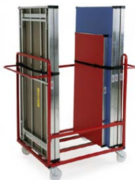
TT MIDI 900 x 825 x 1185 mm

Holds up to 25 rectangular tables Max. 10 x 1500 mm Ø round tables Max. 9 x 1200 mm Ø round tables