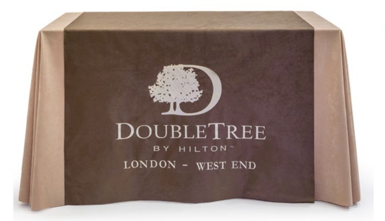
Custom banner cloth with hotel logo (embroidered)