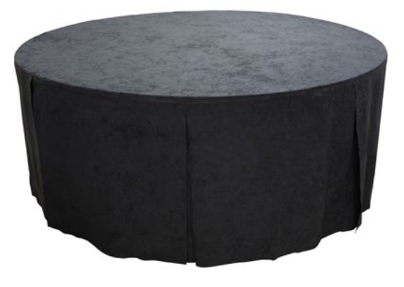
Conference cloth fitted drop cover on a round table. The pleated panels allow for legroom for the delegates