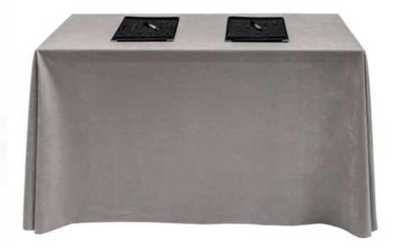
Cut and finished conference cloth (also known as baize) with radius corners