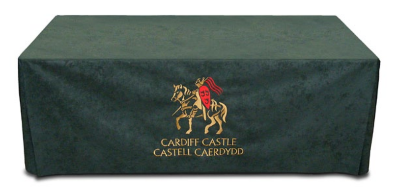
Custom embroidered fitted drop table cover