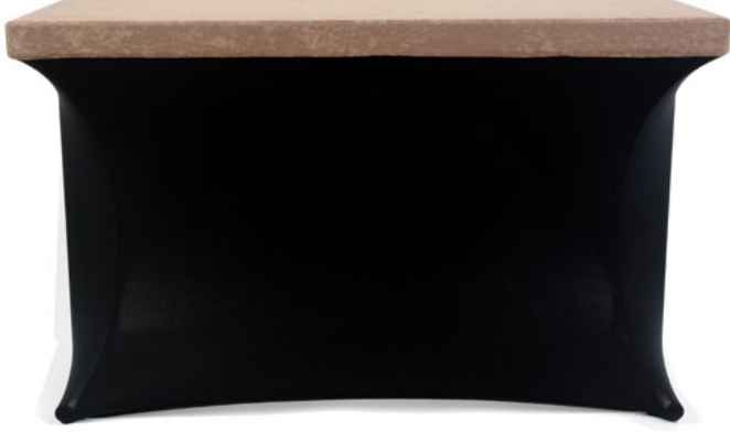
The Mode cover combines stretch fabric with a conference cloth top