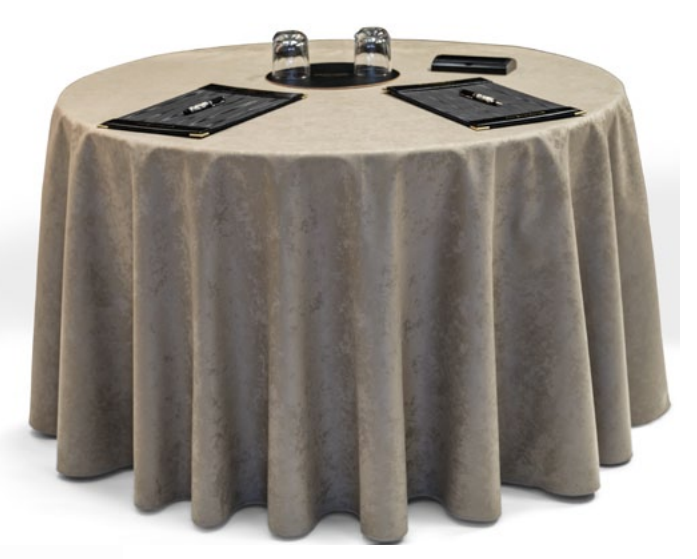
Conference tablecloths can be made for round and oval tables of all sizes