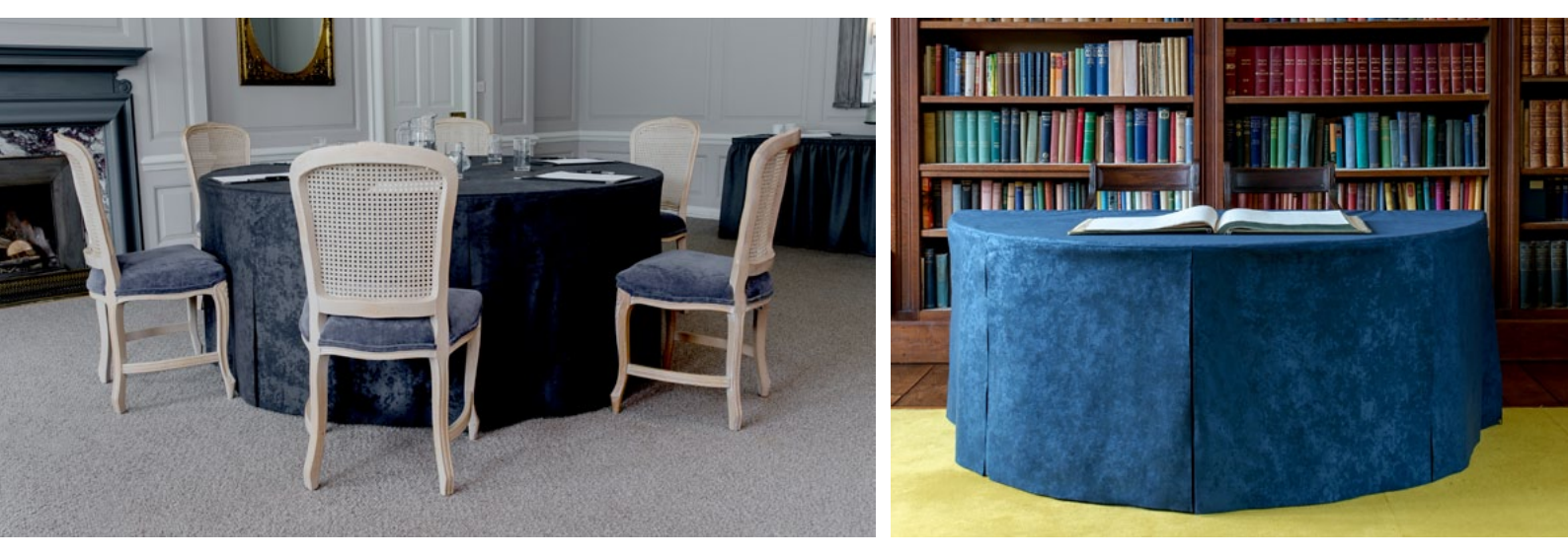
Conference cloth fitted drop cover on a round table with full length edges

Fitted Drop Covers are pre-boxed table covers custom made for an exact fit to your meeting room tables.