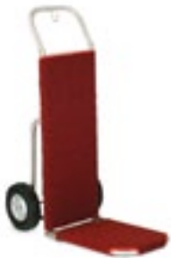
1550-CK Bellman's Handtruck

A wide range of Bellman's Equipment including Handtrucks and Self Service Luggage Carts.