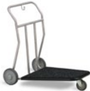
1575-SS Self Service Luggage Cart