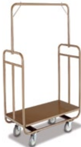
H1211-5 Luggage Cart with epoxy coating