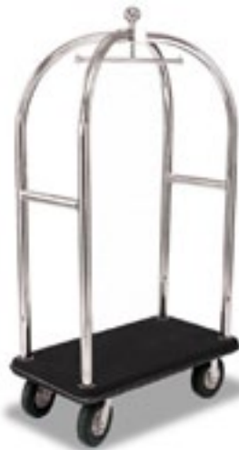
2521-SS Luggage Trolley with stainless steel frame