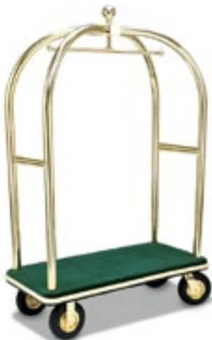
2437 Luggage Cart with solid brass frame