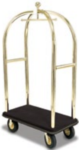
2421 Luggage Cart with solid brass frame