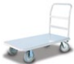
1576 Platform Luggage Truck