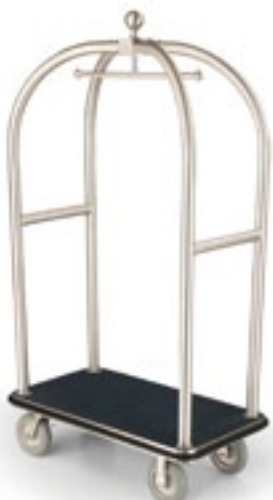
2526-SS Luggage Cart with stainless steel frame