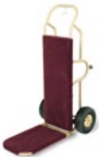
1570-CK Luggage Handtruck