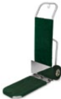
1566-CK-PS Handtruck (1566-X2 shown above)