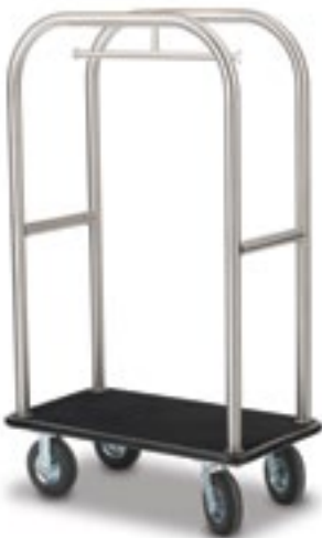
2512-SS Luggage Trolley with stainless steel frame