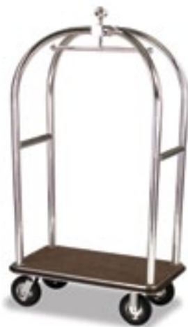
2525-SS Luggage Trolley with stainless steel frame