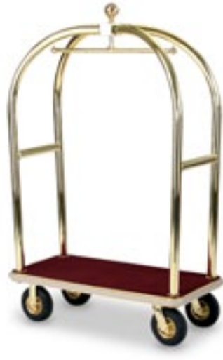
2428 Luggage Cart with solid brass frame