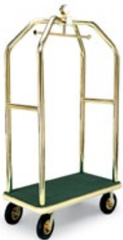
2410 Luggage Cart with solid brass frame