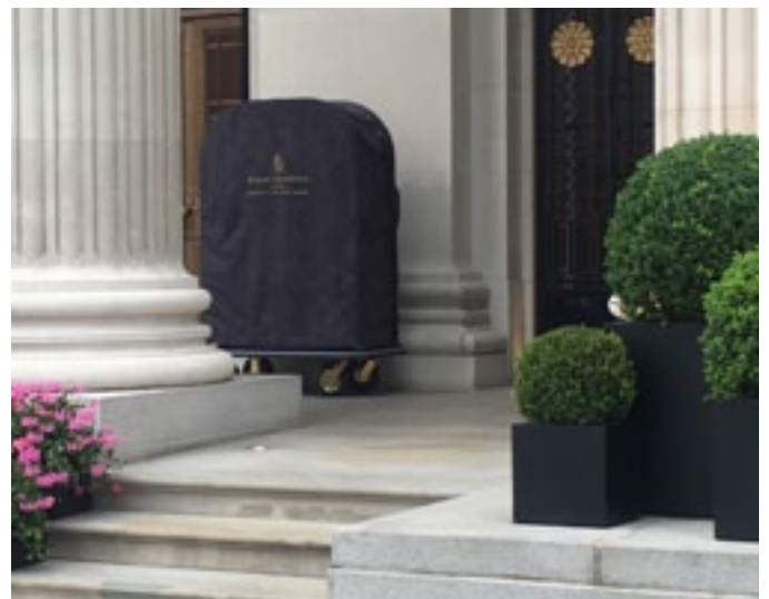
Fabric Trolley Cover personalised with the hotel logo