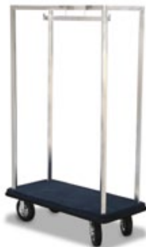
2581-SS Luggage Trolley with stainless steel frame