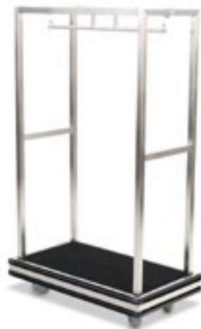
2505DB-SS Luggage Cart with stainless steel frame