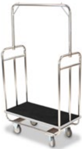
H1210-5C Luggage Cart with carpet

These affordable yet durable luggage trolleys were designed with both aesthetics and practicality in mind. The Economy series of luggage trolleys are models of good sense and reliability.