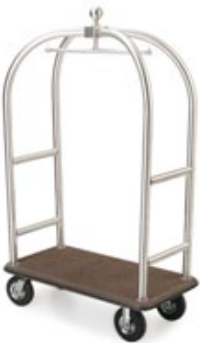
2523-SS-EMEA Luggage Trolley with stainless steel frame