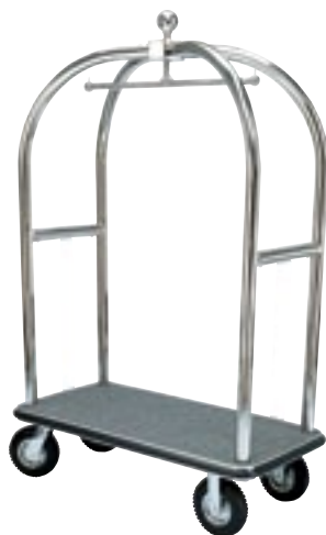
2528-SS Luggage Cart with stainless steel frame