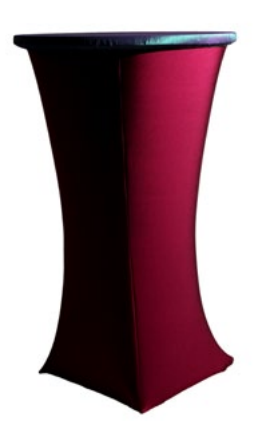
Burgundy red stretch cocktail table cover with elasticated 'topper' in blue (sold separately)